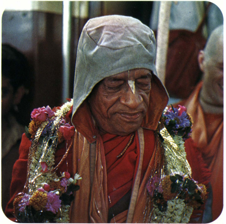
His Divine Grace A.C. Bhaktivedanta Swami Prabhupāda