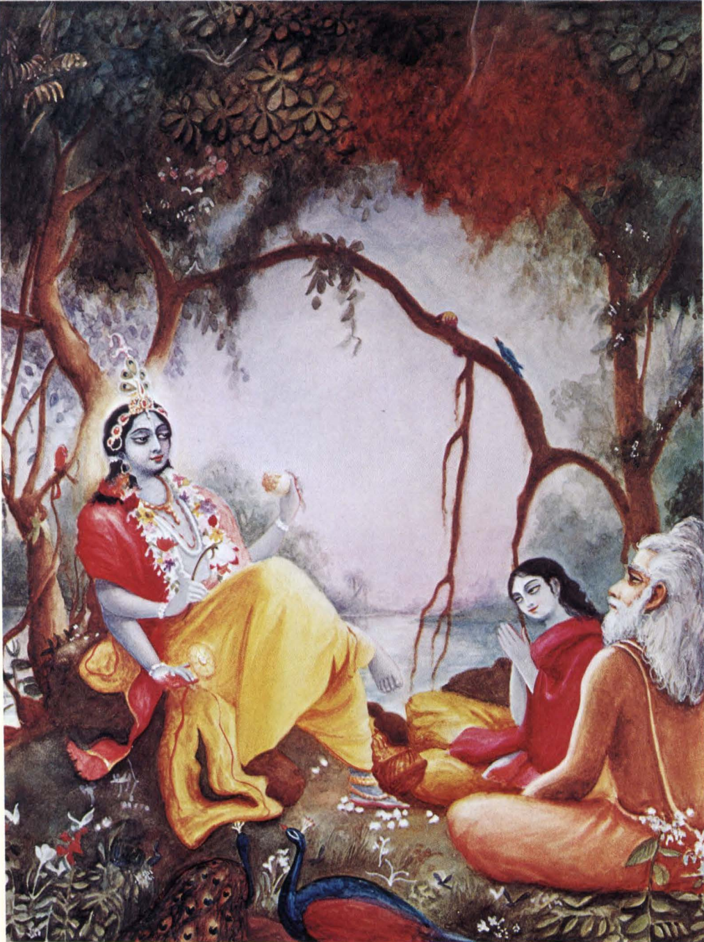
Plate 5 "Because of your pure and unflinching devotional service, your visit to Me in this lonely place is a great boon for you." (p. 129)