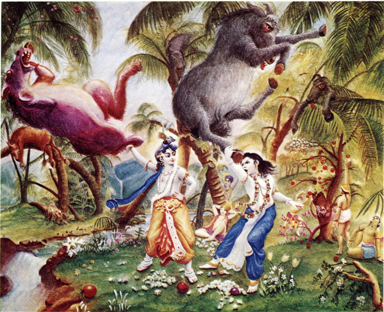
Plate 2 While playing like small children, Kṛṣṇa and Balarāma killed Dhenukāśura and the other ass demons. (p. 86)