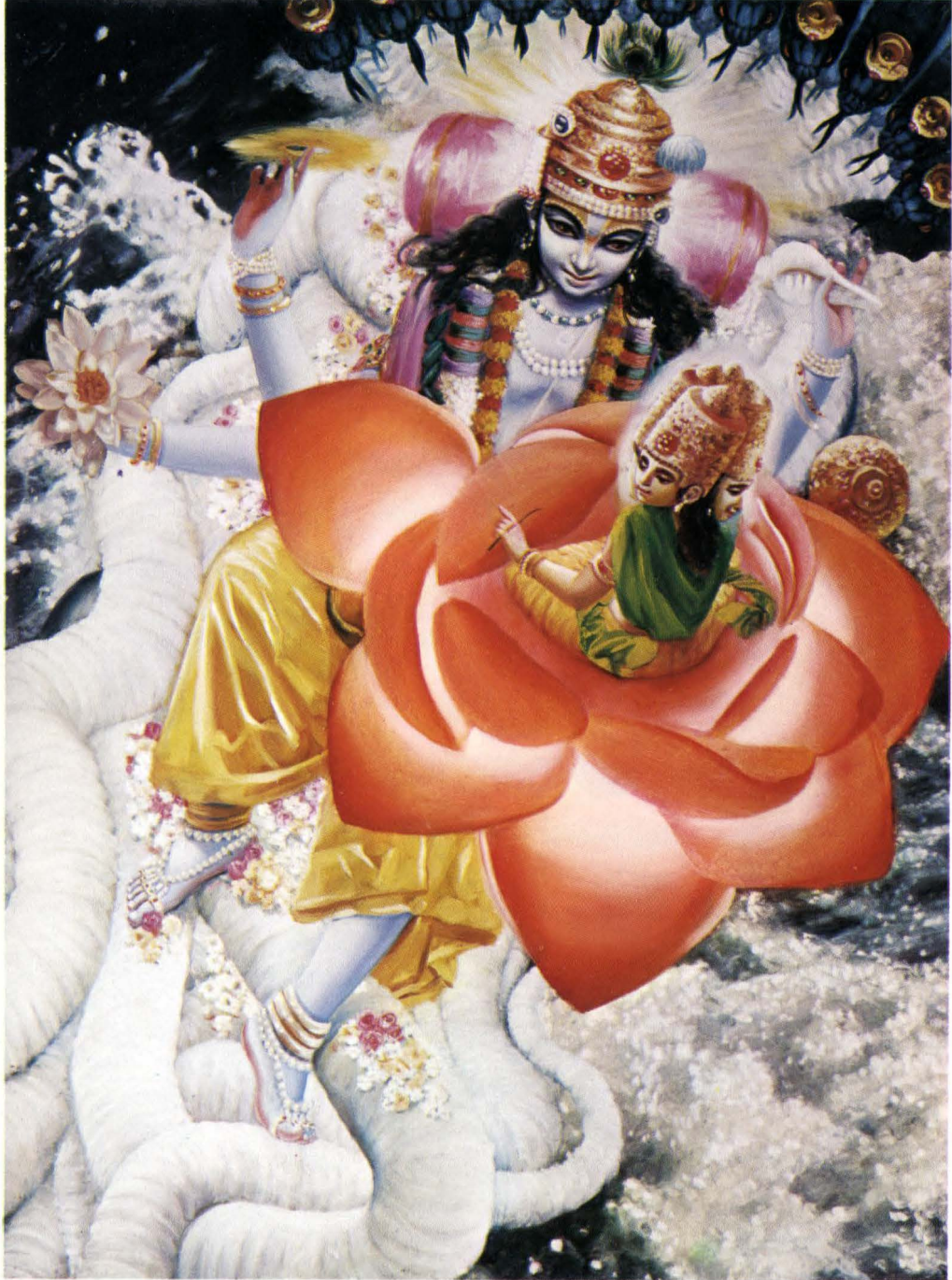
Plate 7 Lord Brahmā could see the Personality of Godhead lying on the lotuslike white bedstead, the body of Śeṣanāga. (p. 322)