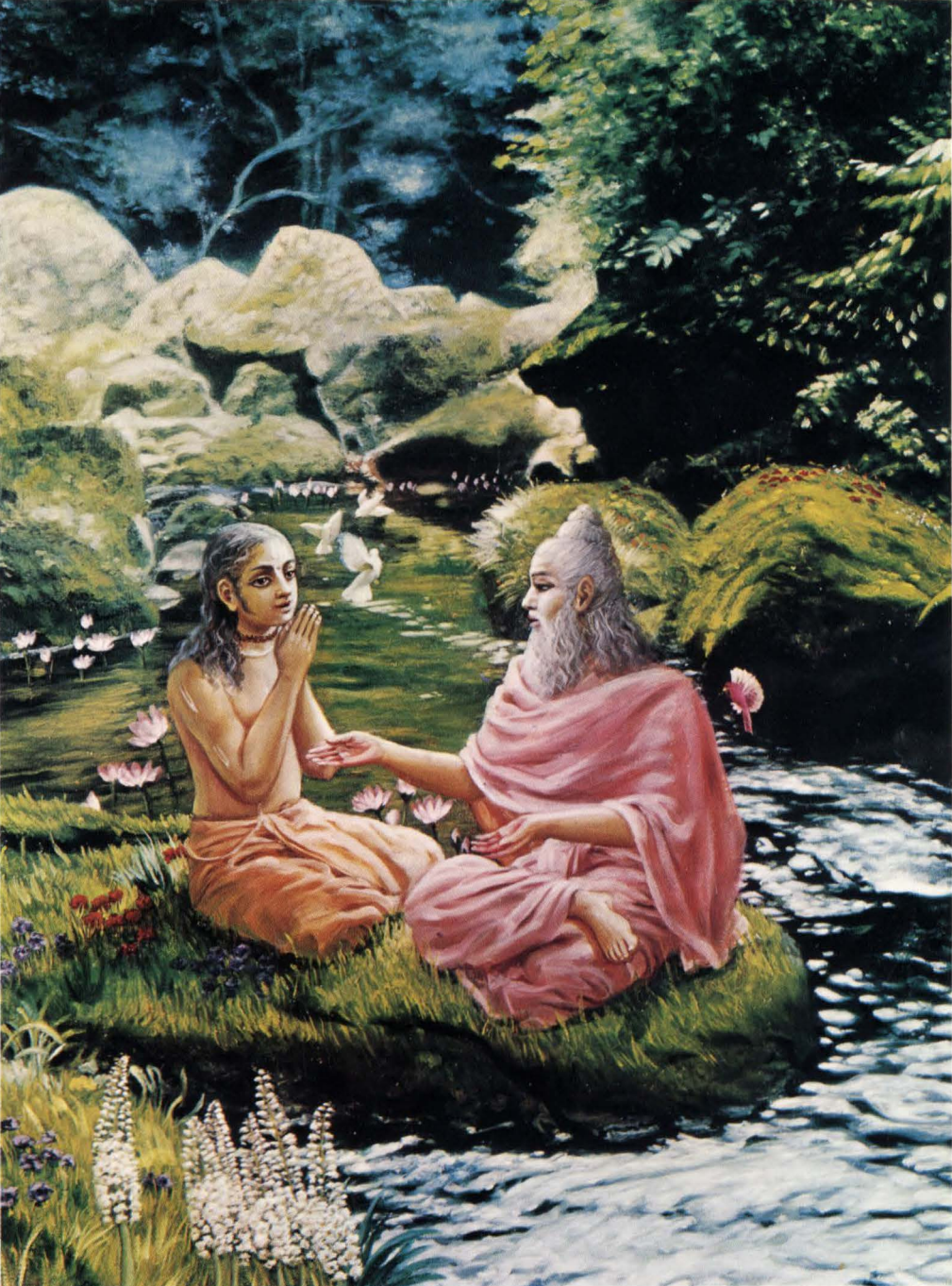
Plate 6 Seated at the mouth of the celestial Ganges River, Vidura inquired from the great learned sage Maitreya. (p. 159)