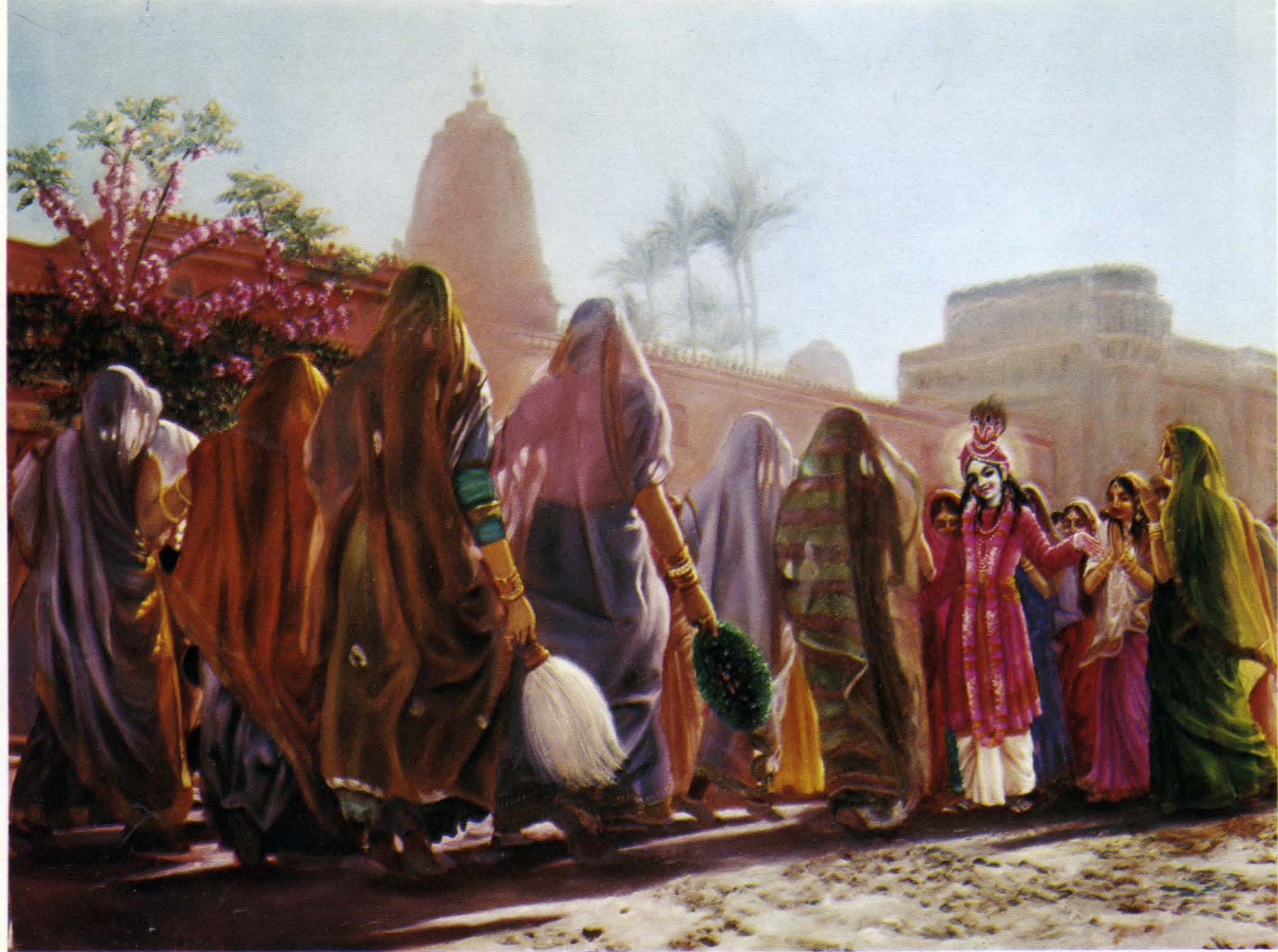
Plate 3 The 16,000 princesses all looked upon Lord Kṛṣṇa with eagerness, joy and shyness and offered to be His wives. (p. 97)