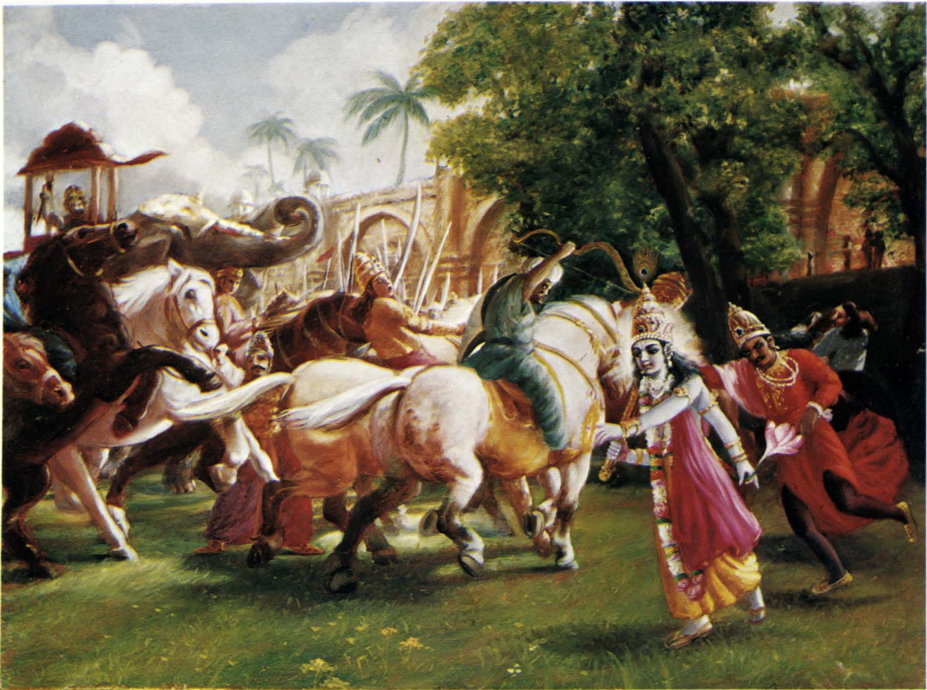
Plate 4 Kṛṣṇa is known as Ranchor, or one who fled from fighting. (p. 100)