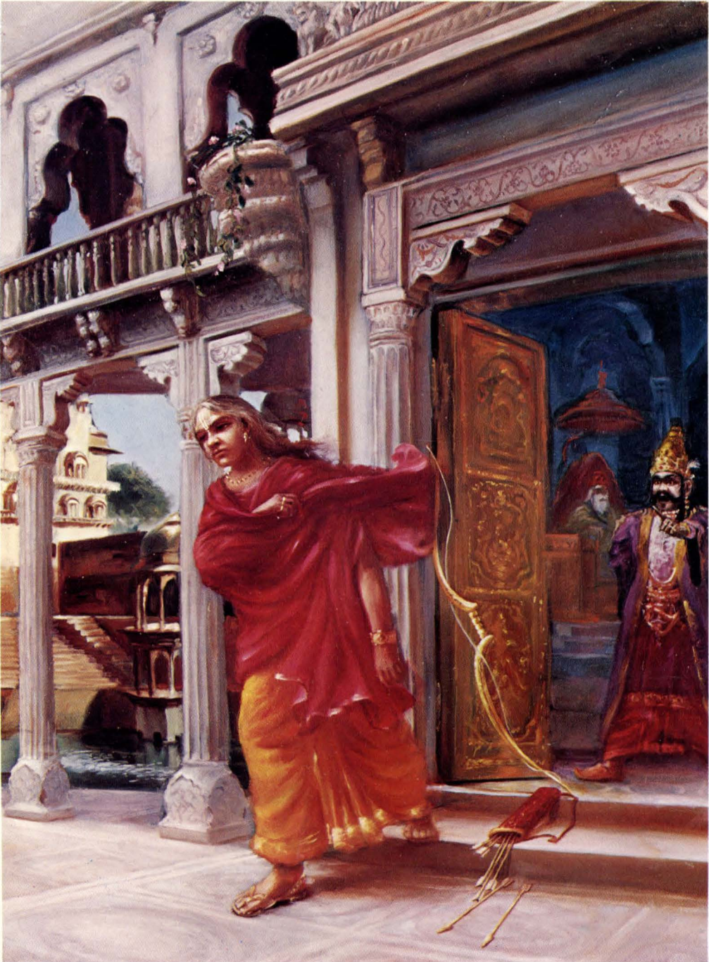
Plate 1 Vidura placed his bow at the door and quit his brother's palace for good. (p. 15)